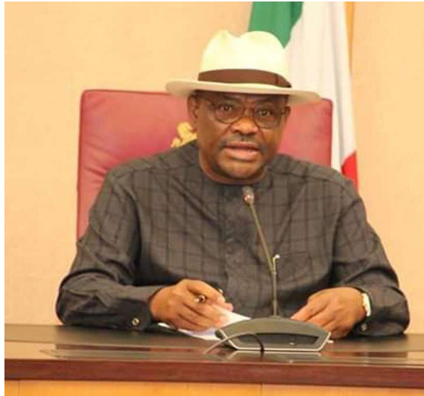
His Excellency Ezenwo Nyesom Wike, CON Executive Governor of Rivers State